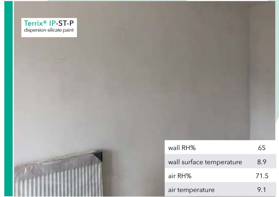
The level of moisture in the substrate is noticeable lower. No staining or black mould.