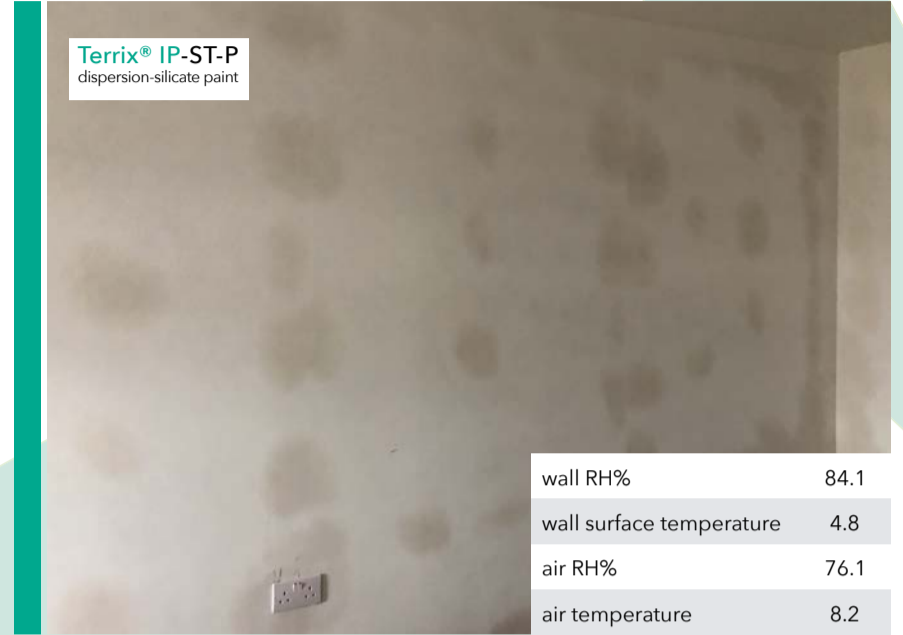
Excess of moisture is clearly visible & freely evaporating through the paint. No staining.