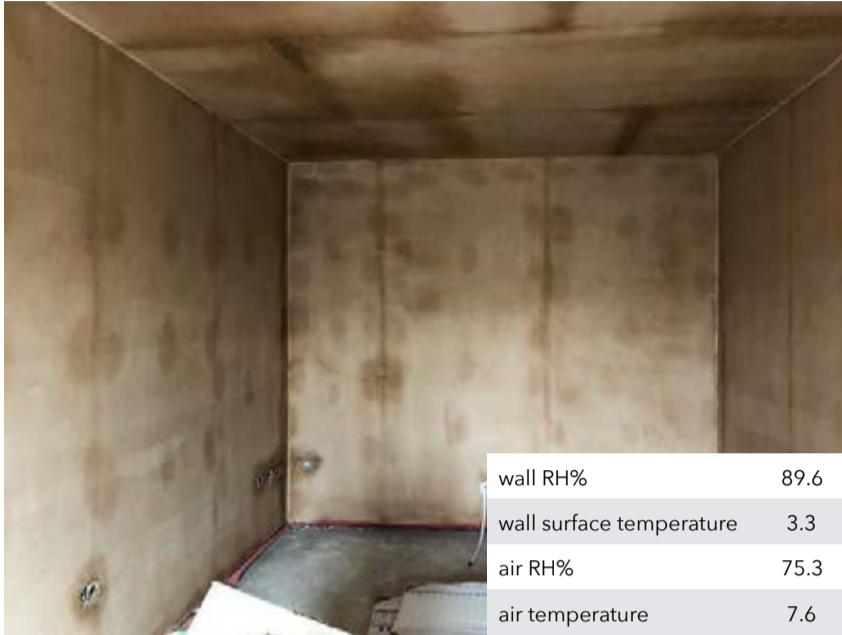
Skim-coat applied to dot and dabbed plasterboard. Substrate - block work The substrate is not suitable for application of any typical emulsion paint.