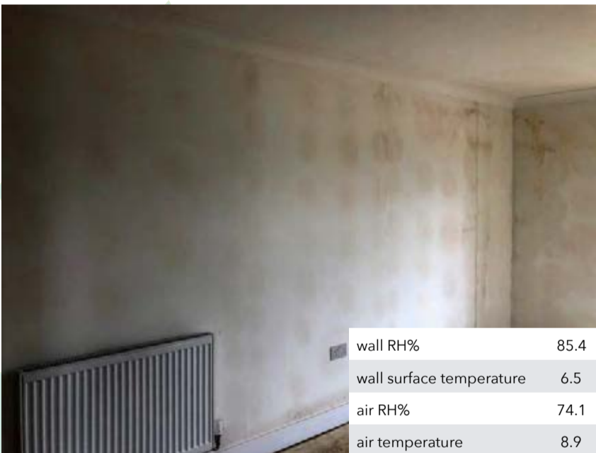
Black mould and staining is clearly visible and penetrating through the paint coat.